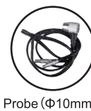
Probe (Φ10mm) (GM130)