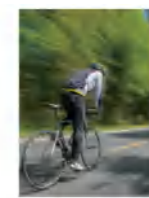
Displacement, velocity, acceleration measurement