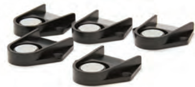
HI920005 Tag holders with tags (5)

Install tags near your sampling points for quick and easy iButton® readings. Each tag contains a computer chip with a unique identification code encased in stainless steel. You can install a practically unlimited amount of tags.