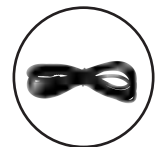
USB data cable