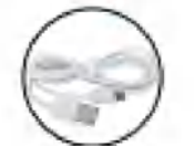
USB cable (GT8911)