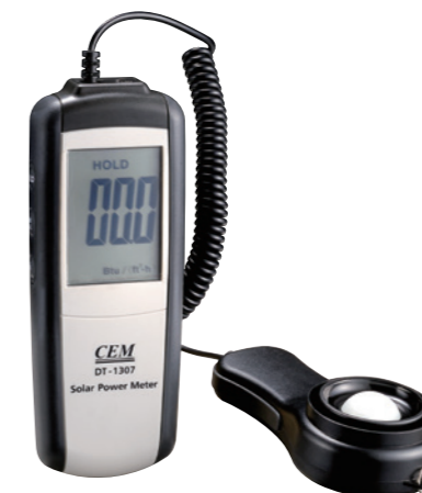
Size(HxWxD): 162mm x 63mm x 28mm Weight: 176g