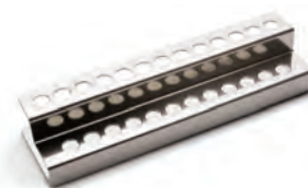
HI740216 Test Tube Cooling Rack

HI740217 safety shield and HI740216 test tube cooling rack should be used when operating the device.