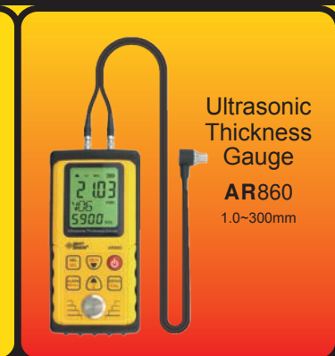
Ultrasonic Thickness Gauge AR860 1.0~300mm