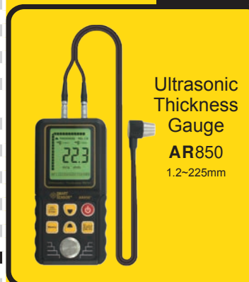
Ultrasonic Thickness Gauge AR850 1.2~225mm