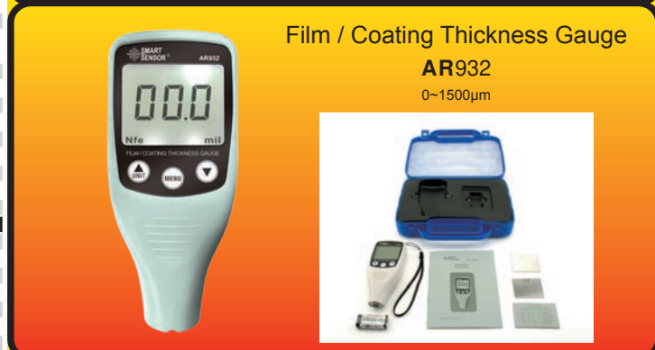
Film / Coating Thickness Gauge AR932 0~1500μm