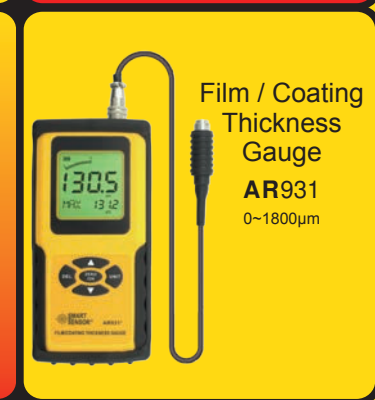
Film / Coating Thickness Gauge AR931 0~1800μm