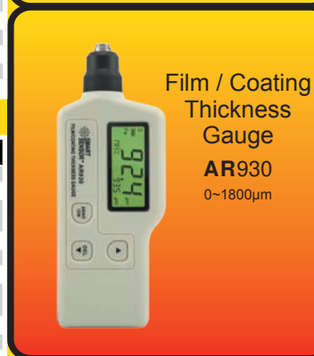
Film / Coating Thickness Gauge AR930 0~1800μm